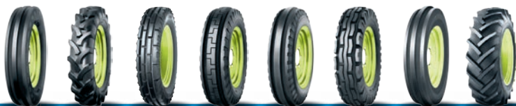
AS-Front 04 AS-Front 06 AS-Front 07 AS-Front 08 AS-Front 08P AS-Front 09 AS-Front 10 AS-Front 13