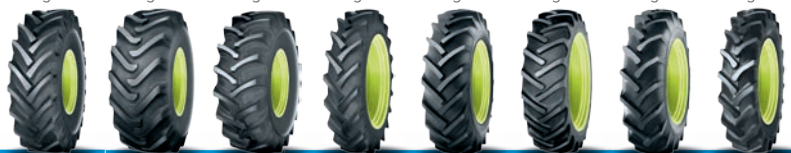
AS-Agri 06 AS-Agri 07 AS-Agri 08 AS-Agri 10 AS-Agri 13 AS-Agri 15 AS-Agri 19 AS-Agri 20