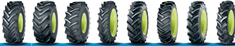
AS-Agri 06 AS-Agri 07 AS-Agri 08 AS-Agri 10 AS-Agri 13 AS-Agri 15 AS-Agri 19 AS-Agri 20