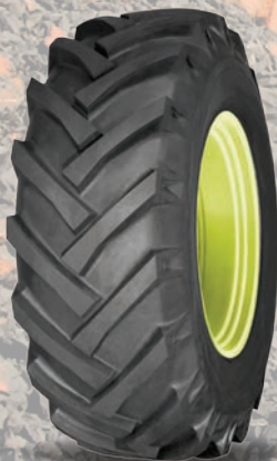
Agro Industrial 20