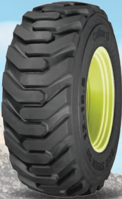
Skid Steer 30