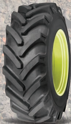
Agro Industrial 10